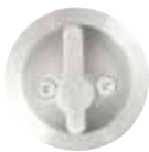
Round Stainless Steel