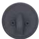
#2 Wrought Steel