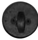
#2 Sandcast Bronze